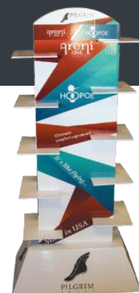
Slatwall with 20 shoes on each floor display