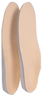
Bi / Tri-Laminate